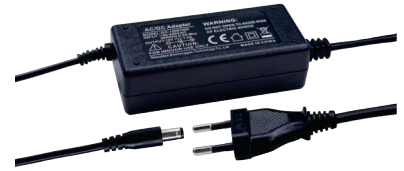
Power Adaptor (EU Type)