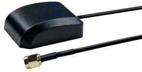
GPS Antenna * Only GPS Version